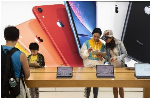
An Apple store in Hong Kong.

Over the last 30 years, prominent American companies have become part of the fabric of Chinese life. Starbucks is as ubiquitous in Beijing or Shanghai as it is in New York. General Motors sells more cars in China than anywhere else in the world. KFC and Papa John's are in all major cities. And Apple has opened 42 of its iconic retail stores.