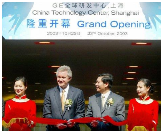
Former GE Chief Jeff Immelt at ribbon-cutting ceremony for a technology center in Shanghai

Now Immelt was losing faith. Growth in the company's key businesses, including power and medical imaging, had begun to slow from the levels GE expected. Government regulators, meanwhile, seemed increasingly hostile, holding up permits and increasing inspections of company facilities for what seemed like no reason. In Rome, Immelt let his fellow CEOs know what he was thinking. "I really worry about China," he told the group, according to several executives present. "I am not sure that in the end they want any of us [foreign companies] to win, or any of us to be successful."