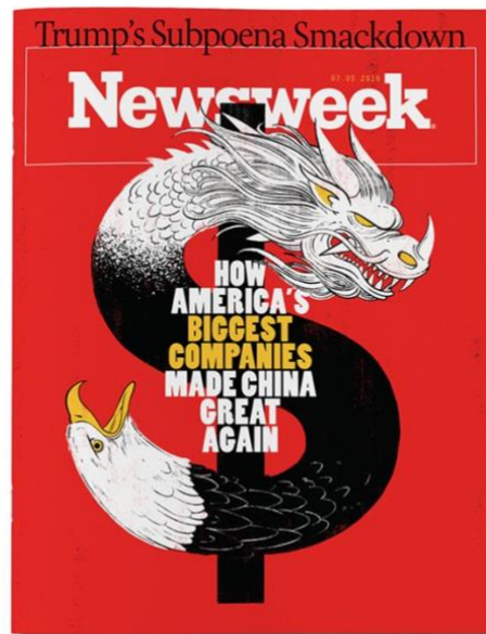
ILLUSTRATION BY ALEX FINE FOR NEWSWEEK WORLD CHINACOMPANIES

BY BILL POWELL ON 06/24/19 AT 12:21 PM EDT